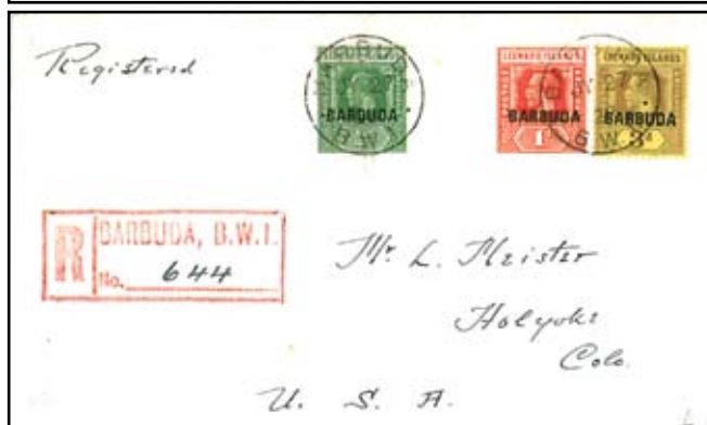
FIGURE 9a & b

Two of a set of four matching Mister Meister covers to Holyoke, Colorado, each bearing low values of the 1922 issue of Barbuda with consecutive registration numbers (641-644), indicating a particularly philatelic item.